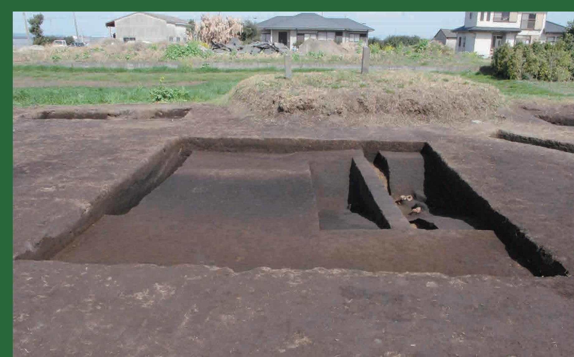
An investigation site